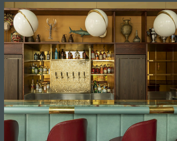
ABOVE: How the Lounge looked Before